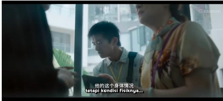
Image 6. Attempting to teach at a school but being rejected due to physical disability