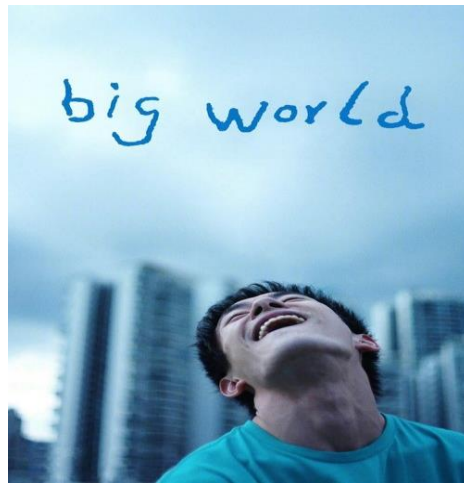
Figure 1. The movie Big World 2024

continues to strive toward her aspirations and never gives up in the face of her circumstances. (Taufan, 2025) .