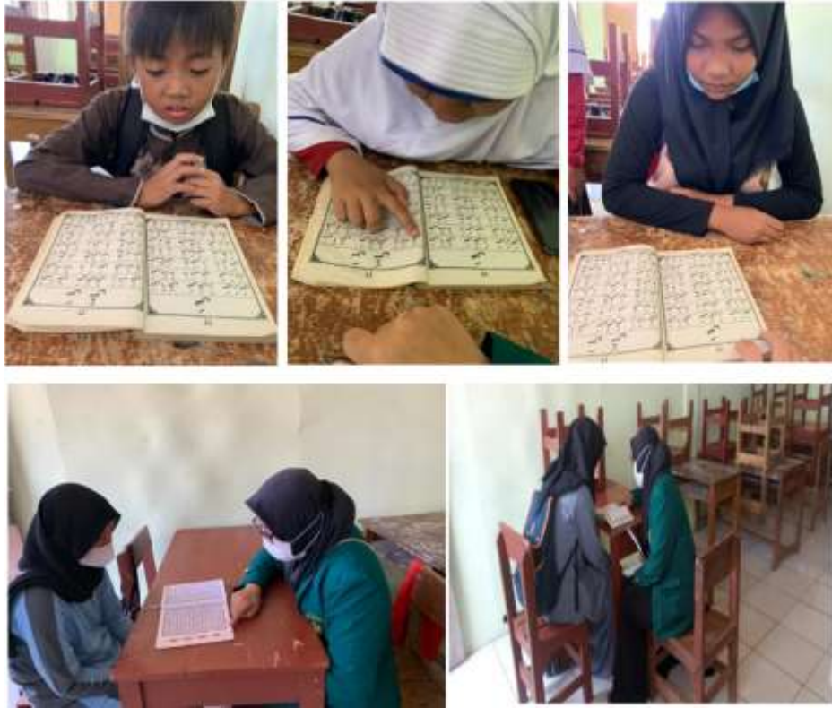
Qur'an Teaching Activities

In the discussion of the interview results, there are several conclusions from each point stated, namely the following, the results of the interview of each respondent of the 1st question, 64% show that the respondents always read the Qur'an at their respective homes. The results of the 2nd question showed that respondents were 50:50 when asked that it was better to study at school or at home. The result of the 3rd question. 2.5 do not understand the method of Ash-Shafi'i because there is a lot of ignorance of Ash-Shafi'i material because so far they have read the Qur'an and have not applied good laws and readings. As a result of the 4th question, respondents felt that learning using the Ash-Shafi'i method could improve the ability to read the Qur'an. And the results of the 5th question, almost 100% show that the respondents are very helped by the Ash-Shafi'i method.